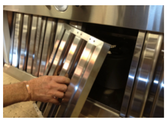
Step 10 Put filter back into place

Questions or Concerns: Please feel free to contact us directly at (818) 765-9870