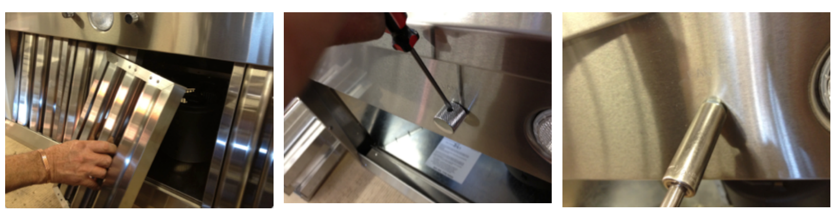
Step 1 Remove Filters.