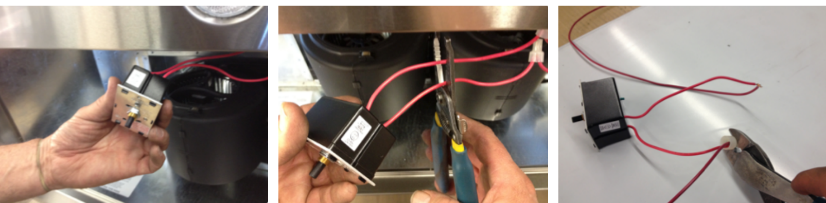
Step 4 Reach behind the panel and pull out the blower switch.